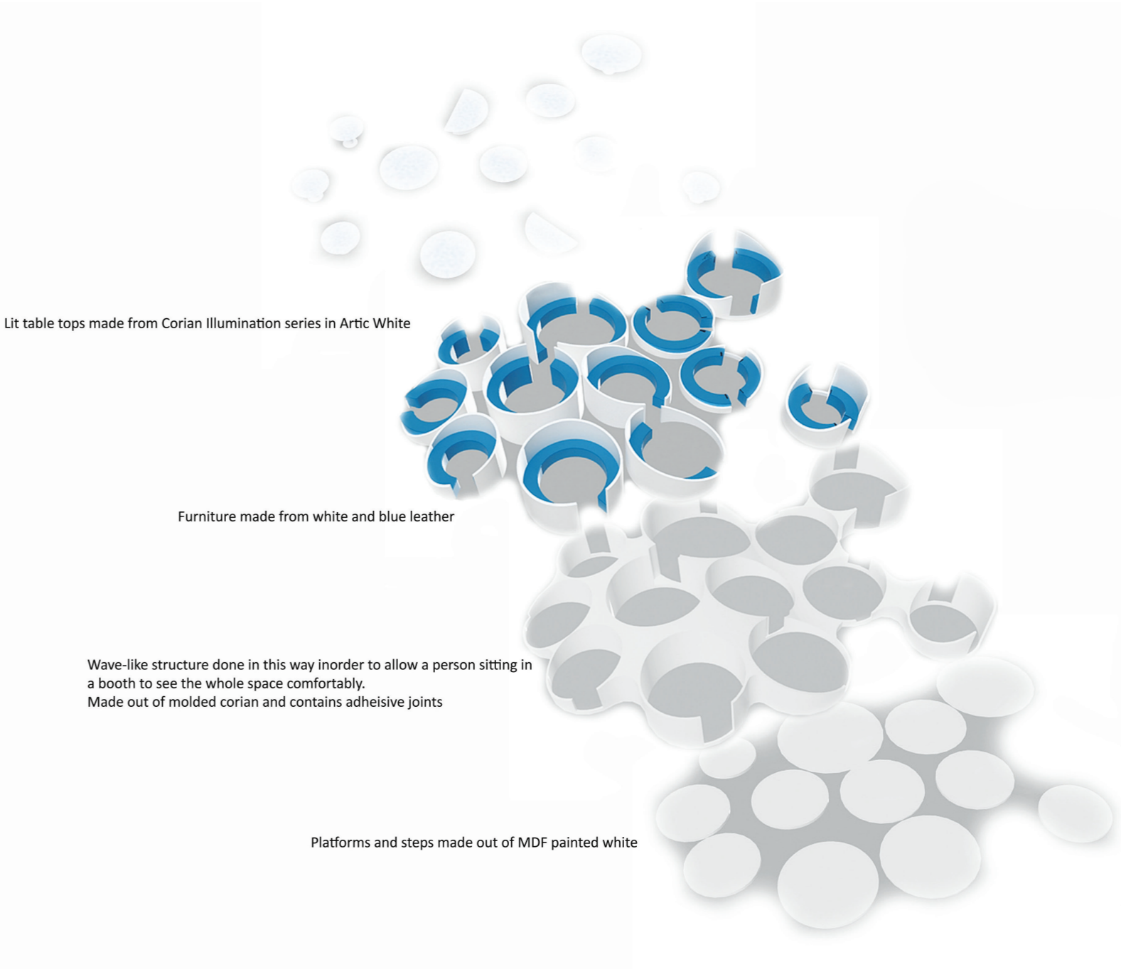
Lit table tops made from Corian Illumination series in Artic White